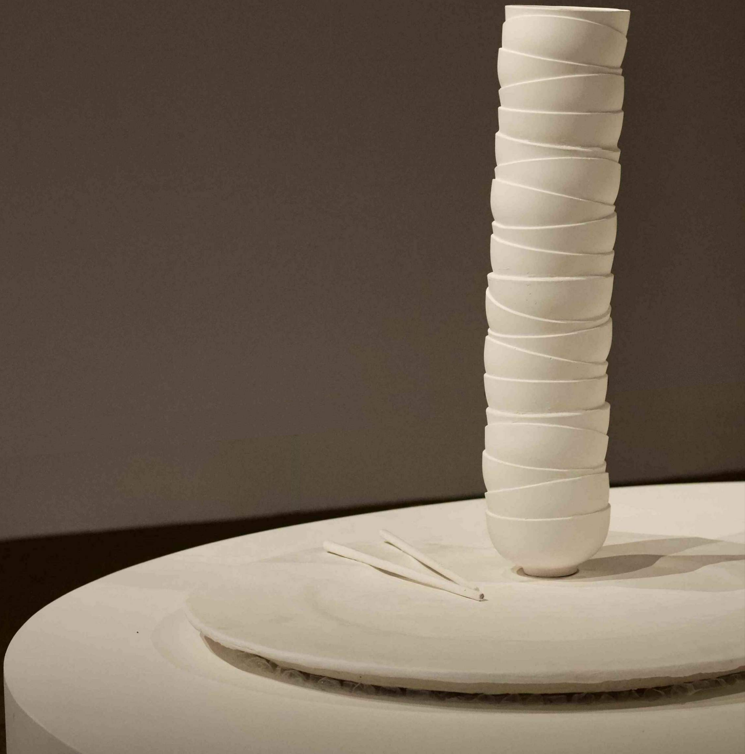
Chúng ta là một thể hợp nhất/ We Are An Unmistakable Fusion, 2023 Wood, mdf, and plaster 35 x 50 x 40 cm

At its heart, what this exhibition really explores are the intersections of person and place, and the trauma of displacement. If Descartes posited the question 'who am I' as the most fundamental of human concerns, then the question 'where am I?' is surely the most poignant. To not know where one is gives rise to intense anxiety: when we experience a breakdown of orientation and lose our bearings, we lose our confidence as well. And to live without a sense of place is true deprivation, one that we look to literature, music and art to relieve. Art often tells us who we are; sometimes, it can help us work out where we are, too.