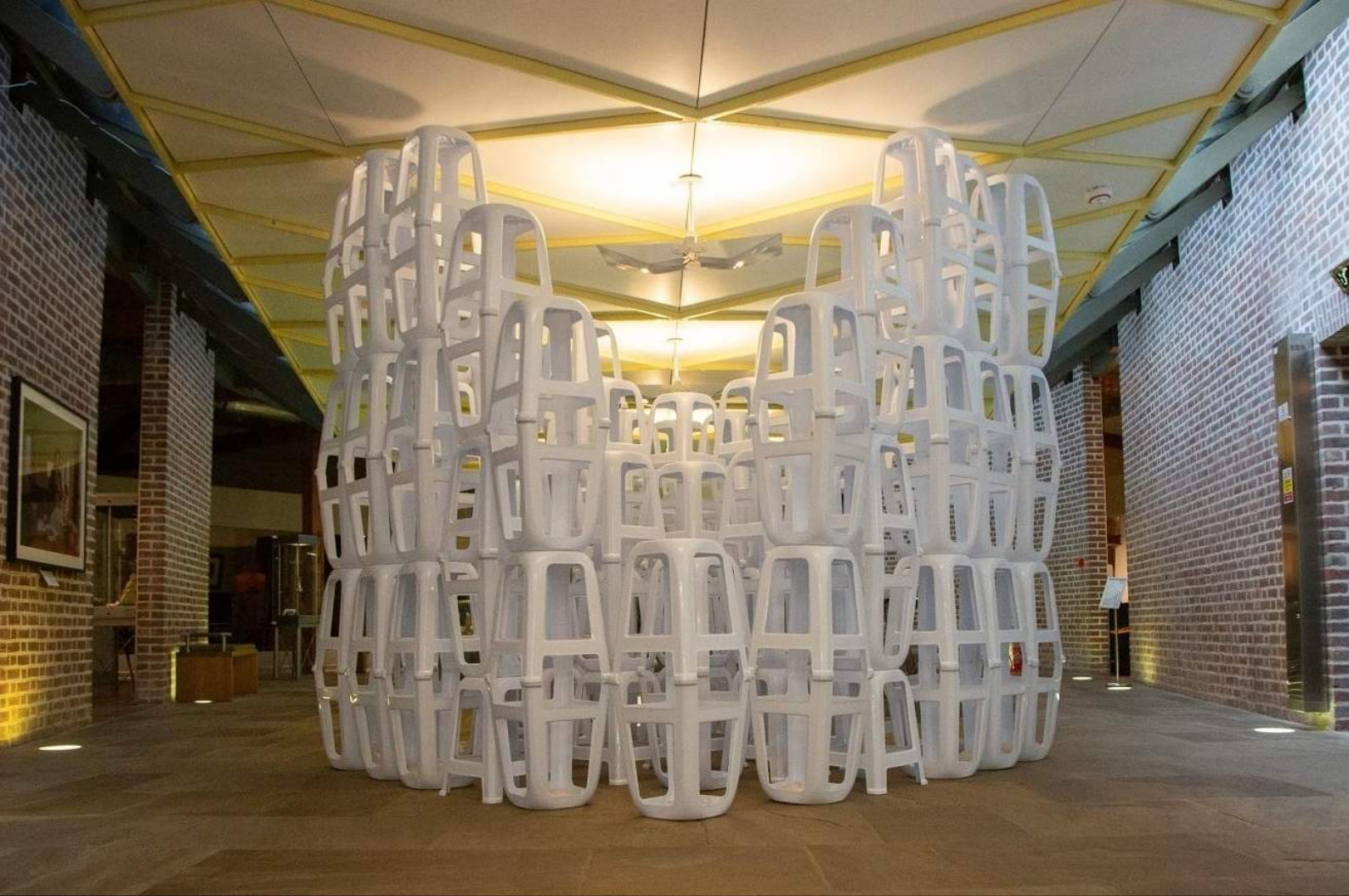
The Cityscape, 2023 KV Duong & Hoa Dung Clerget 135 white plastic stools, rice bags Dimensions variable