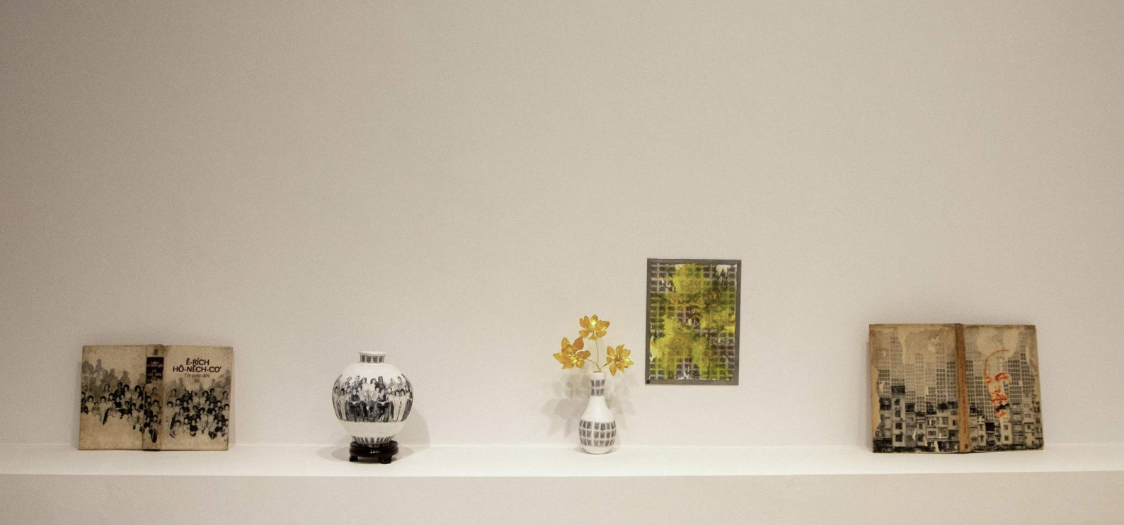
KV Duong - various works, 2023