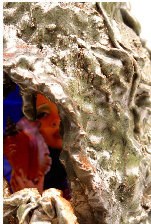
Twin whisperings , 2023 Stoneware and crank clay, glaze, metal, aluminium, plastic, android screen 46 x 28 x 23 cm