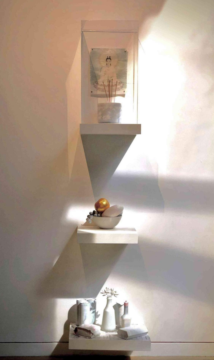
Displaced Shelving, 2023 KV Duong Quan Âm's portrait, incense burner from Bát Tràng village, store bought offerings, spray paint, acrylic box, IKEA shelves Dimensions variable