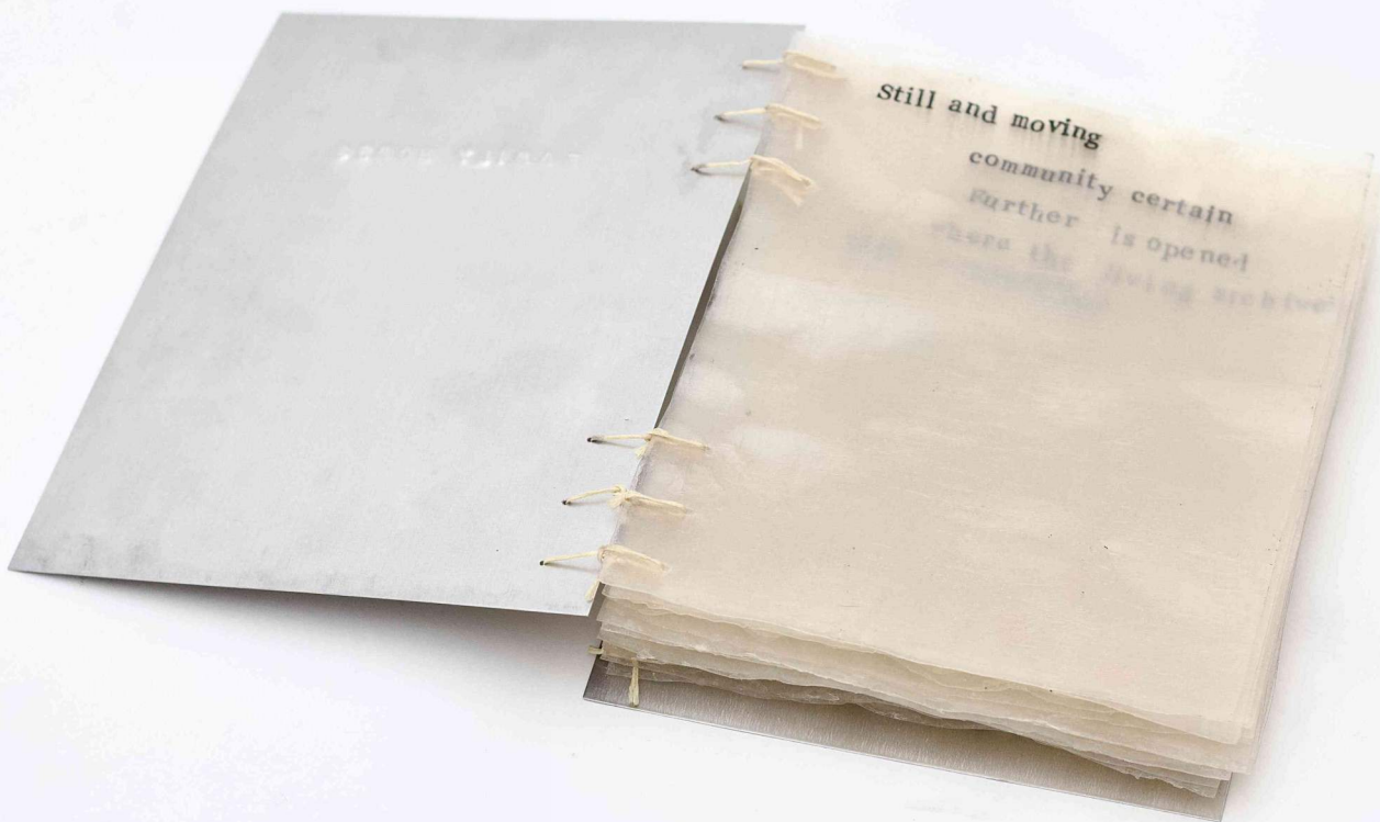
Thân/ Family Homes, 2023 Handbound book, Rice paper and aluminium 21 x 32 x 8 cm