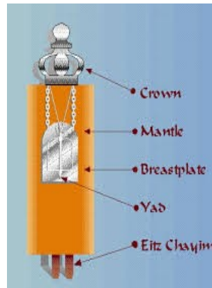
Figure 2. The Tôrāh 'Clothed'

represents the Tôrāh 'clothed' (how it is placed inside the `Aron or carried in the processions in solemnities as in the feast of the Simchàt Tôrāh ) if one compares it with the Shroud imprint.