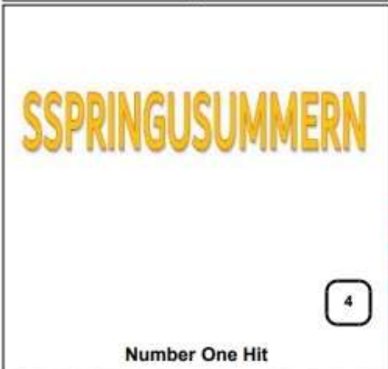
Number One Hit