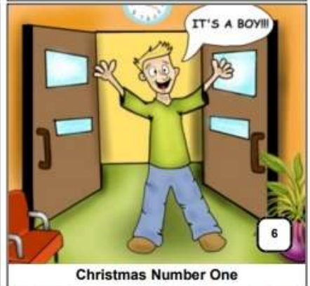
Christmas Number One