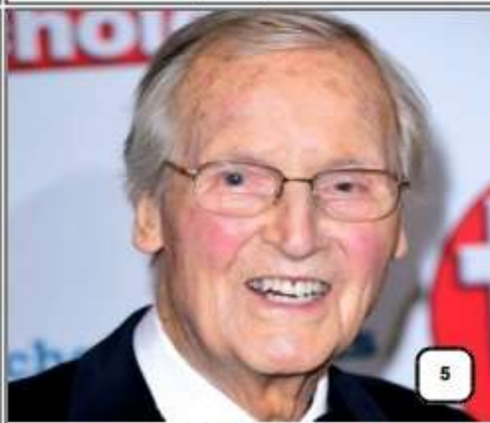
Died in 2020