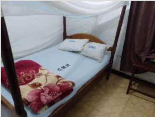
UGX 26,000 / KES 930 Per Bed

The contacts are +256 771216656 plus the ones on the sign post.