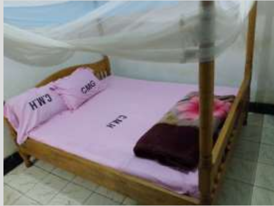
UGX 31,000 / KES 1100 Per Bed