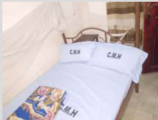
UGX 40,000 / KES 1430 Per Bed