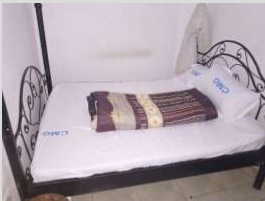
UGX 36,000 / KES 1300 Per Bed