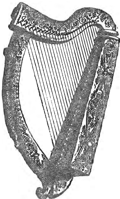
BRIAN BORU'S HARP.

plectrum." He describes it as "similar to the canora cythara of the Latins of the Middle Ages, and the origin of the modern guitar." Another form of cruit was the reamhine cruit , which the same author tells us was "the cruith of the Welsh," and is said to be the parent of